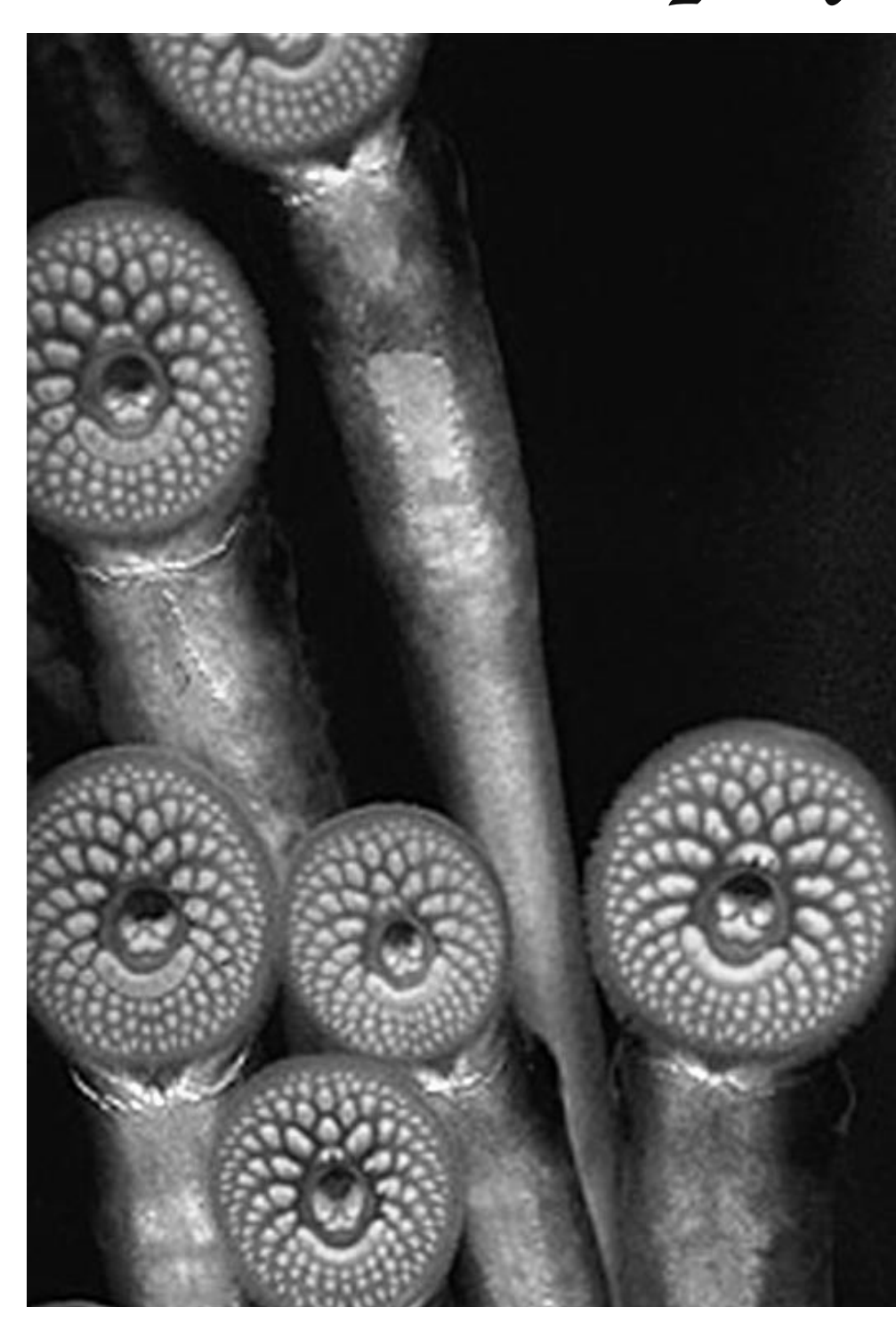
PECULIAR PARASITE — The Sea Lamprey continues to fascinate and repel us. The eel-like creatures clamp on to lake trout and other fish in order to feed on their blood.

The Great Lakes Fishery Commission's vision is an integrated program that uses pheromones, traps and chemical treatment to suppress the sea lamprey population, summed Ebener. Researchers do have a successful model, he said. Using pheromonebaited traps, scientists have largely succeeded in eradicating boll weevils from U.S. cotton fields in the southern United States.