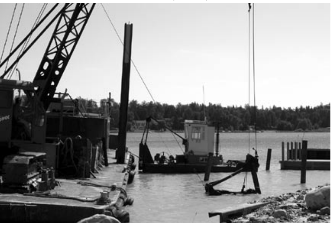
While dredging, MCM Excavating struggles to get the jaws around one of many huge boulders at the McKay Bay access site on Lake Huron.