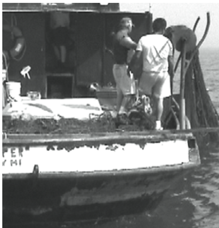
Two abandoned trap nets were pulled from Lake Huron by a trap netter hired by CORA.

to be abandoned, contact your local tribal or state conservation enforcement agency.