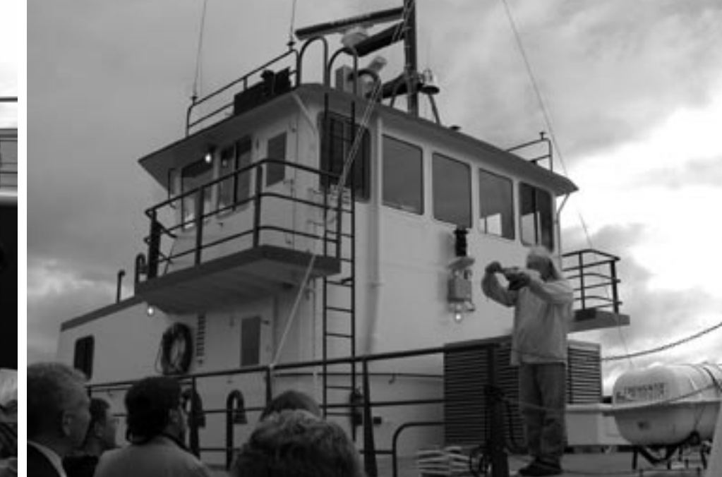
Pipecarrier Dwight "Bucko" Teeple smudges the Sturgeon with the four medicines.