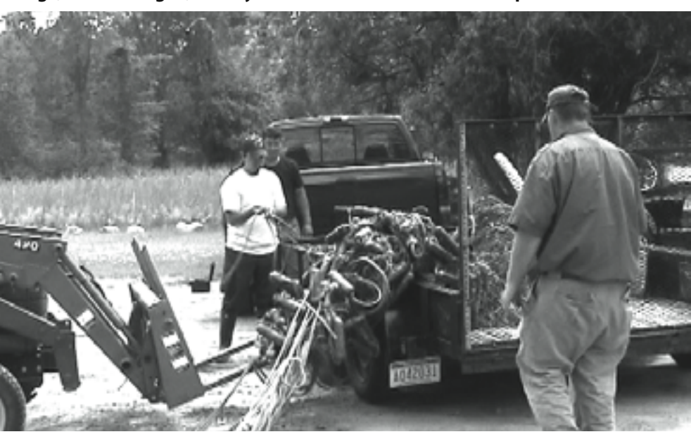
A crew from Little Traverse Bay Bands Maintenance meet conservation officers to pull the net ashore with a tractor and load it into a trailer for disposal.