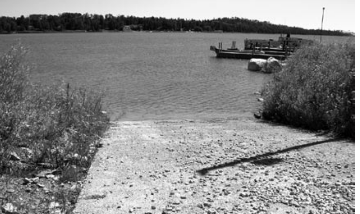
The site was dredged to a depth of 4 feet below low water and boulders moved from the launch site's path.