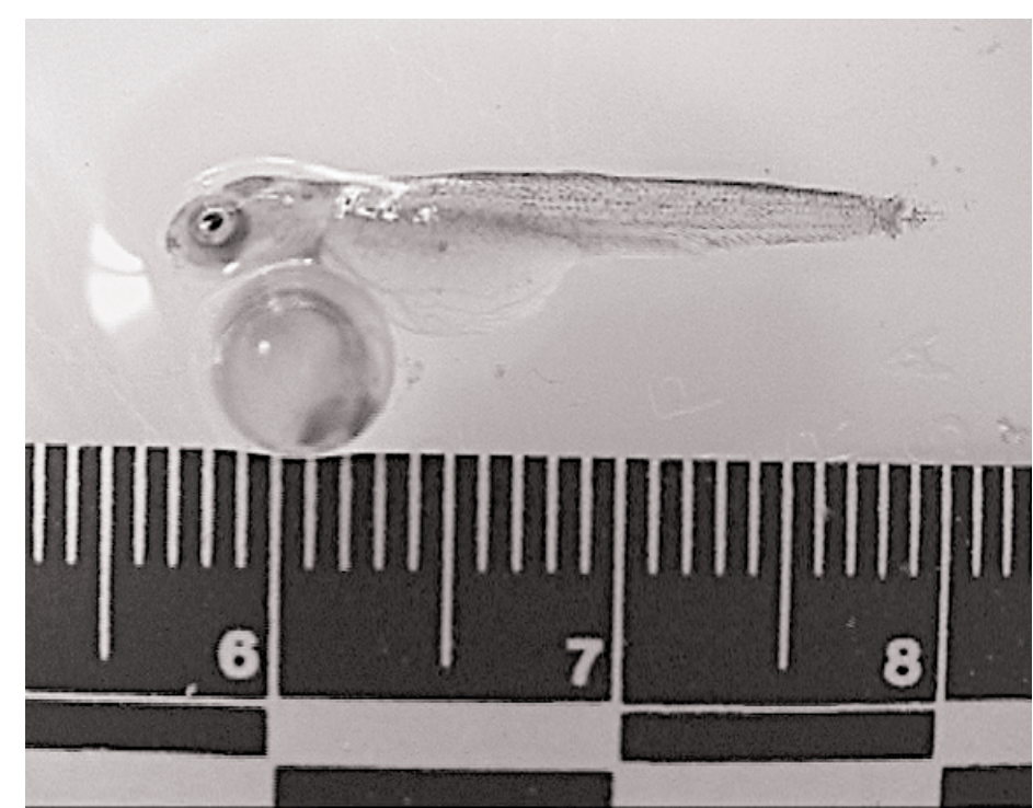
Lake trout in egg stage and fry stage, products of the Little Traverse Bay Band Fishery Program. The Odana Fish Enhancement Facility produced fry for the first time last

As the last fish are removed, aquaculture businesses are turning their attention to hauling out and disinfecting all of the nets, pens and other equipment. Even the boats used to tend and harvest the fish will be taken out of the water to be sanitized. Then the companies must wait four to 16 months before replacing the pens and slowly starting to raise fish again.