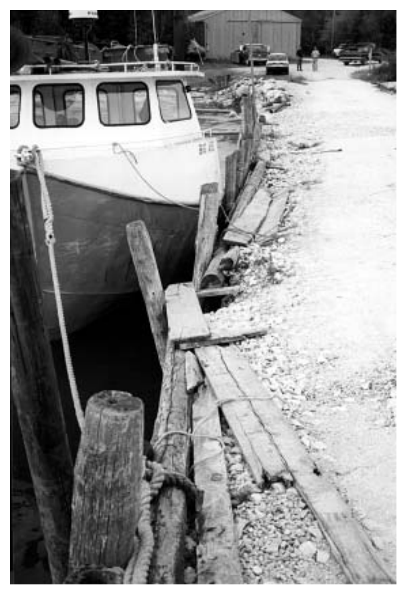
Existing docking and mooring facilities at Dutcher's are in need of repair.