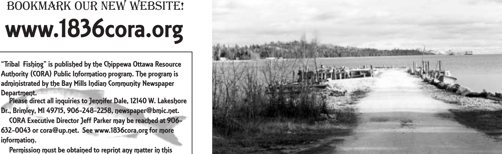
Buildings at McKay Bay have been removed.

administrated by the Bay Mills Indian Community Newspaper