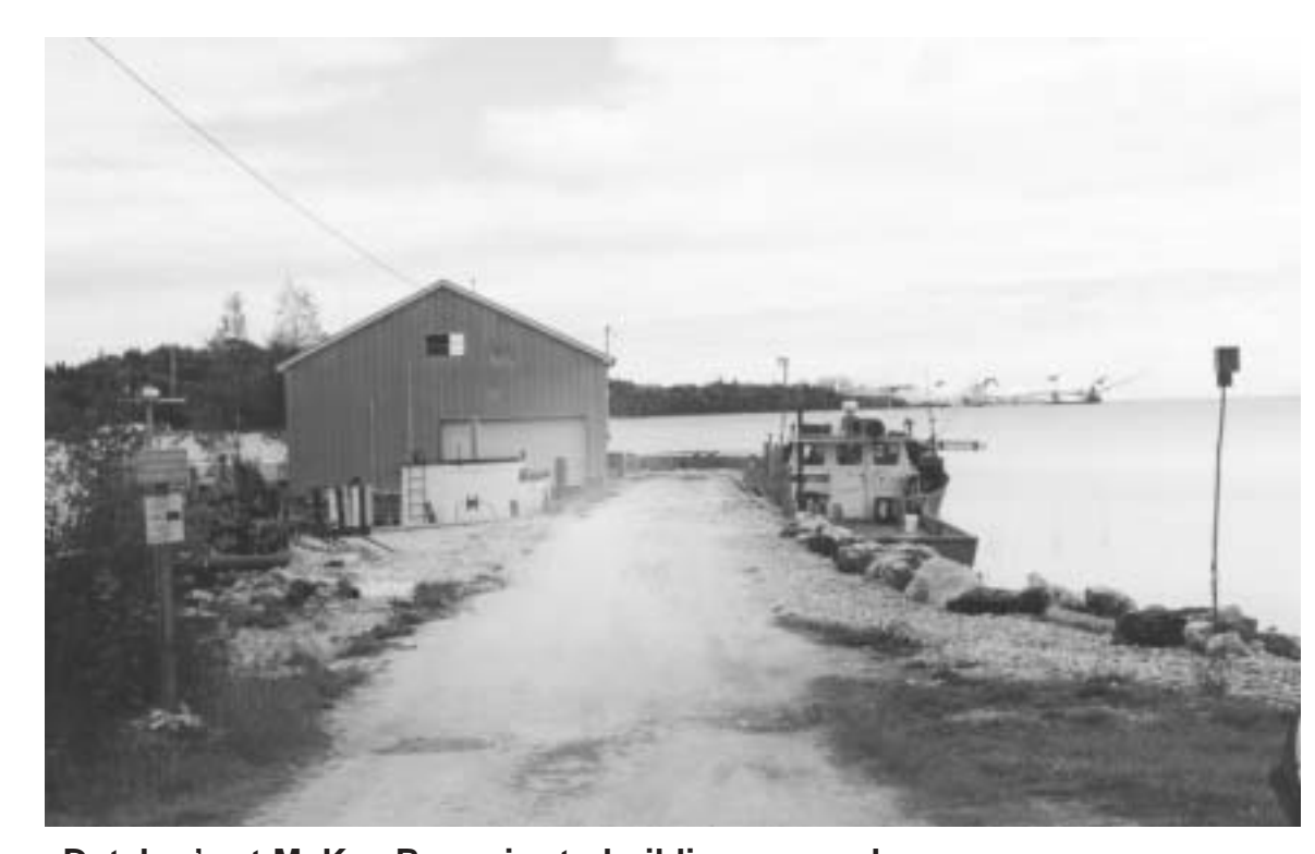
Dutcher's at McKay Bay prior to building removal.